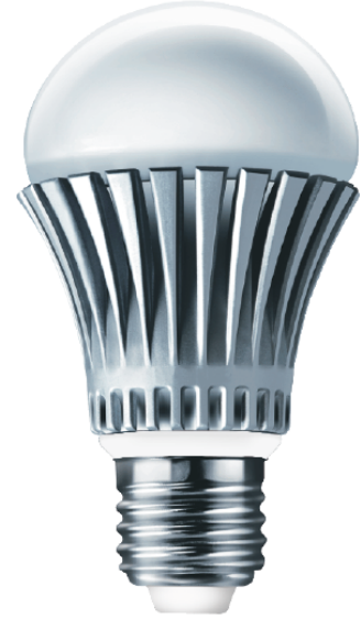
CAP:E27 *Design Picture*