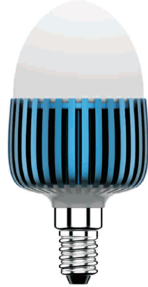
CAP:E14 *Design Picture*

The LED globe can provide soft and symmetrical lighting without strobe. It can be used in places, such as residential homes, markets, hotels/motels, or offices.