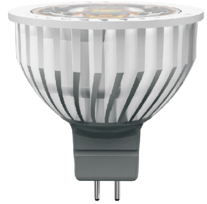
CAP:GU5.3 *Design Picture*

Please refer to the product itself for the actual appearance